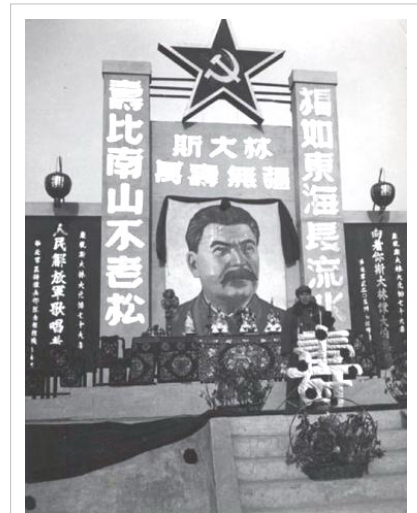
Chinese communists celebrate Joseph Stalin's 70th birthday, 1949

In the social sciences, the approach of Friedrich and Brzezinski came under criticism from scholars who argued that the Soviet system, both as a political and as a social entity, was in fact better understood in terms of interest groups, competing elites, or even in class terms (using the concept of the nomenklatura as a vehicle for a new ruling class). [19] These critics pointed to evidence of popular support for the regime and widespread dispersion of power, at least in the implementation of policy, among sectoral and regional authorities. For some followers of this 'pluralist' approach, this was evidence of the ability of the regime to adapt to include new demands. However, proponents of the totalitarian model claimed that the failure of the system to survive showed not only its inability to adapt but the