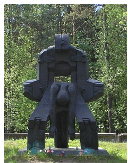
Moloch of Totalitarianism – memorial of victims of repressions exercised by totalitarian regimes, at Levashovo, Saint Petersburg.

Aside from fascist and Stalinist movements, there have been other movements that are totalitarian. The leader of the historic Spanish reactionary conservative movement called the Spanish Confederation of the Autonomous Right declared his intention to "give Spain a true unity, a new spirit, a totalitarian polity..." and went on to say "Democracy is not an end but a means to the conquest of the new state. When the time comes, either parliament submits or we will eliminate it." [7]